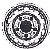
16" White Steel w/Mini-cap and Lug Nut Covers Optional: SRW