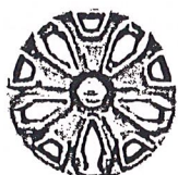
16" Black Steel w/Silver-Styled Cover Optional: SRW