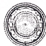
16" White Steel w/White Front Hubcap Optional: DRW

Standard Optional, at extra cost — Not applicable