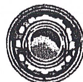
16" Silver Steel w/Silver Front Hubcap Standard: DRW