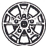
16" Aluminum w/Locking Lug Nuts Optional: SRW